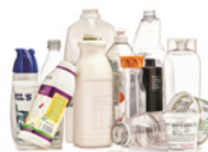
PLASTIC Bottles, Jars, Jugs, & Tubs