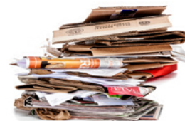
PAPER & CARDBOARD Mixed Paper, Newspaper, Magazines, & Boxes