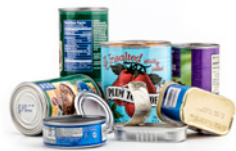
METAL Food & Beverage Cans (non-aerosol)

ONLY the items listed below should go in your household recycling bin. If you're unsure, don't risk contaminating the load and place the item in the trash.